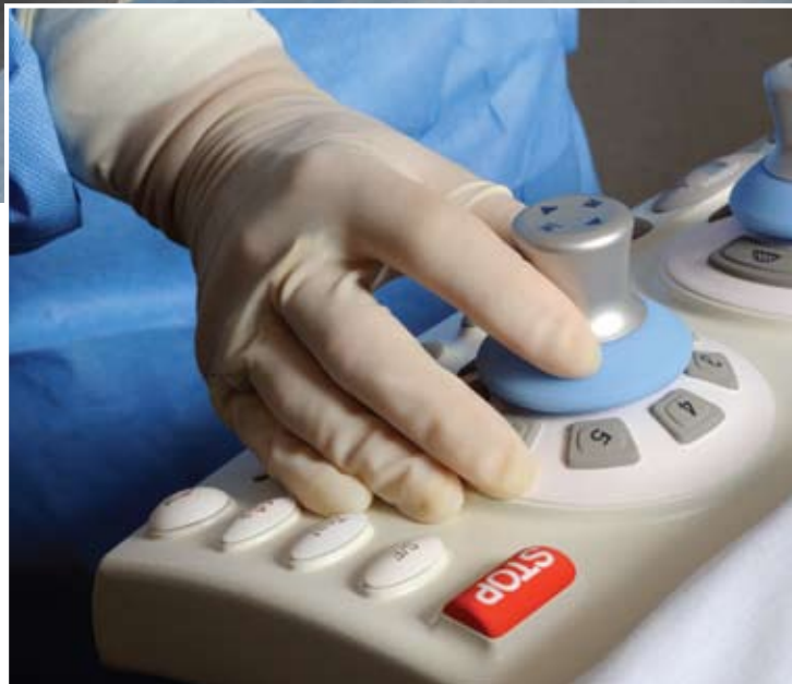
Cardiac catheterization brings the gold standard of care in cardiac diagnostics to Milford Regional.