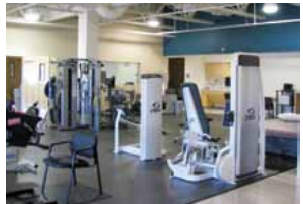
Thanks to a generous donation from CYBEX, Milford Regional’s Rehabilitation and Sports Medicine Center has leading-edge equipment.