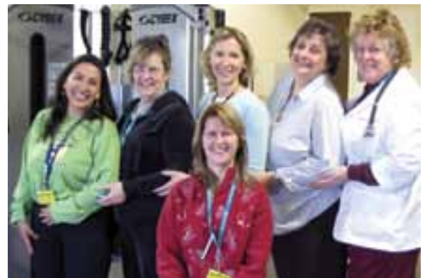
Therapists at the Rehabilitation and Sports Medicine Center help patients get back to their active lifestyles.

○ For more information about sports medicine services at the Medical Center, visit www.milfordregional.org , click the “Health Services” tab, then click “Rehabilitation & Sports Medicine.”