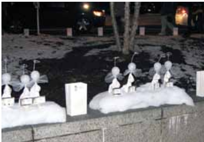
Silver angels and luminaries lit by generous donations